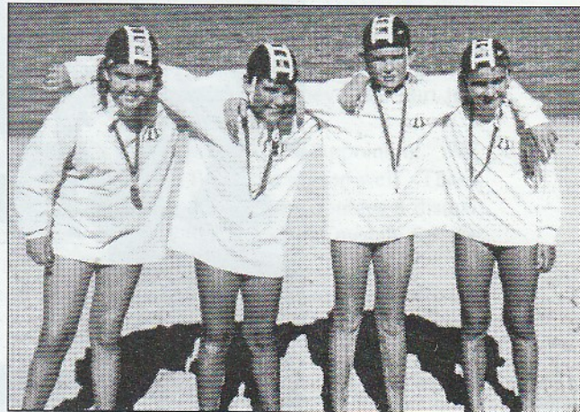
U10 Wade relay team - "WINNERS"!