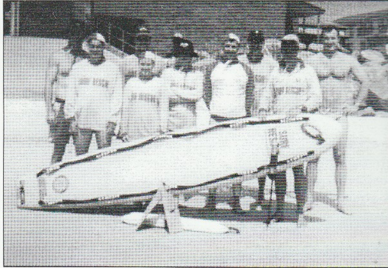
Christmas Day Patrol 1998